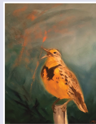
In addition to teaching music, Leslie Dawe '92 has also taken up painting